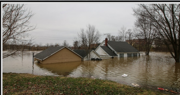
East Main & State Street