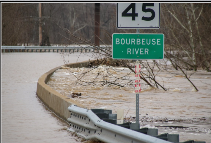
Highway 50 at Bourbeuse River Bridge