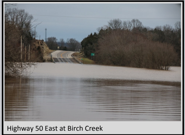
Highway 50 East at Birch Creek

The City would like to thank Franklin County Government, the Union Fire Protection District, all of the volunteers, residents, and staff who assisted with the flood recovery efforts. While there is still a long road ahead, the load is lightened by the number of people working together to help those who were impacted.